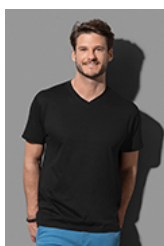
ST2300 Classic-T V-neck