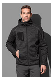
ST5860 Recycled Fleece Jacket Hero