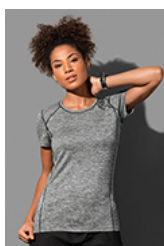
ST8940 Recycled Sports-T Reflect