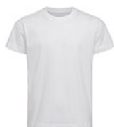
ST9370 Jamie Organic Kids