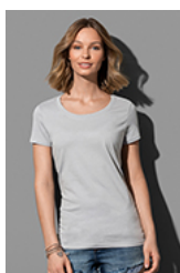
ST9300 Janet Organic Crew Neck